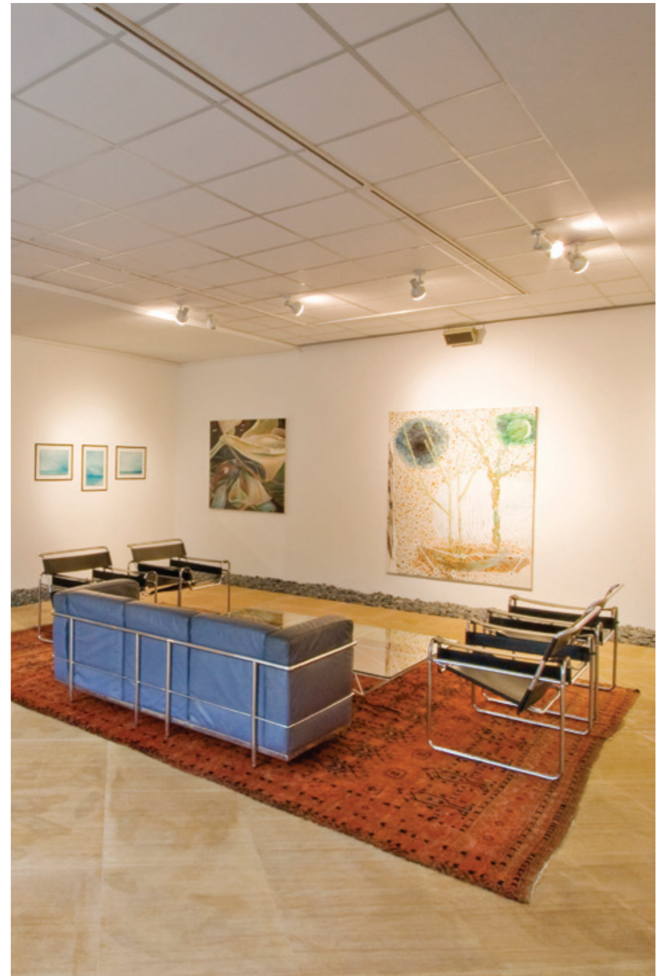
Rimbun Dahan Gallery

Malaysia's creative hubs need long-term support as well as recognition for their efforts. Their impact may often be intangible, but it is invaluable. International partners have provided both funding and platforms for creative hubs for years. The next question is whether more Malaysian partners in the government, non-government and private spheres can do the same.