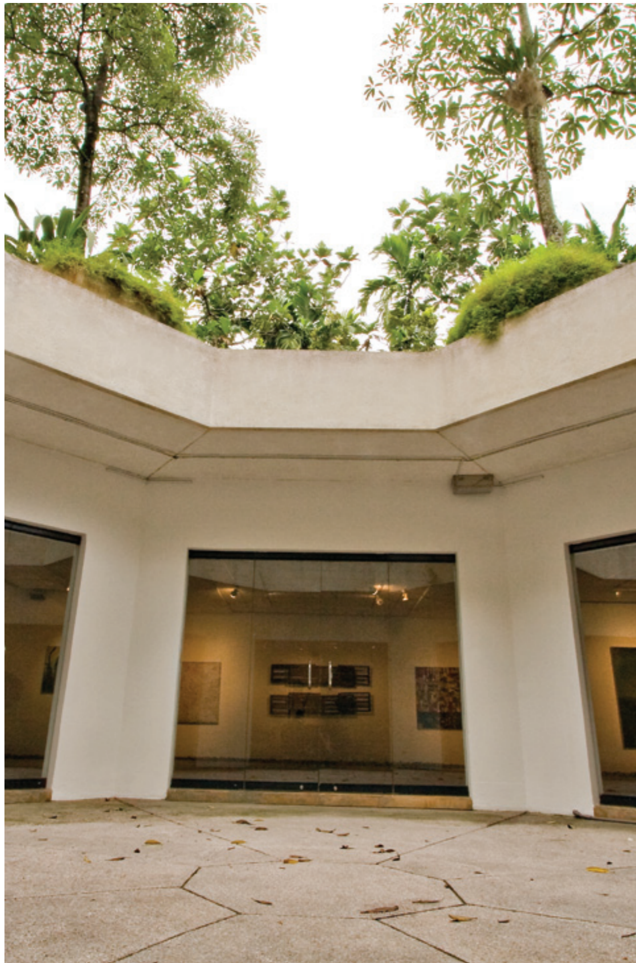
Rimbun Dahan Gallery